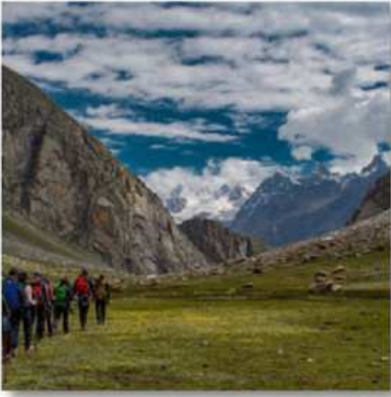
Views of Spiti valley