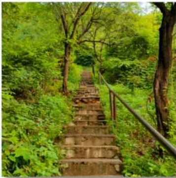
Beautiful Forest Routes