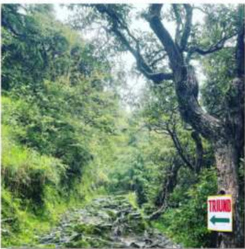
Flora & Fauna