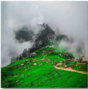
Views from Triund Top