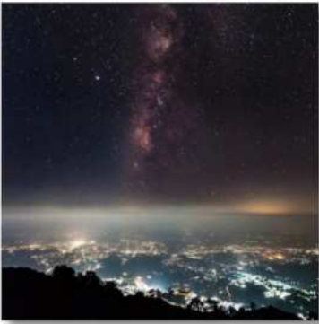
Majestic Night Sky View